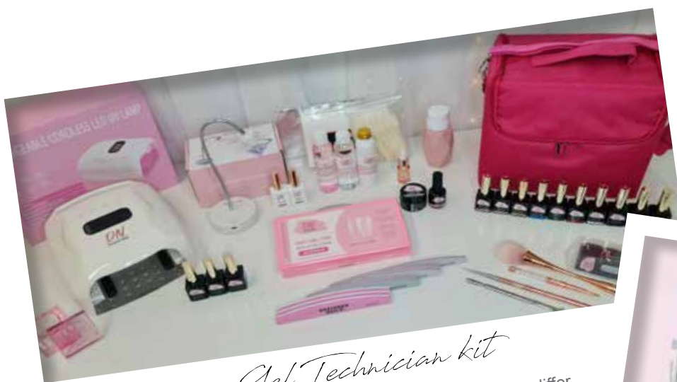
Gel Technician kit Kit contents subject to change; some items may differ

Theory of Nails written exam Practical exam: Natural nail prep using e-file cuticle burr bit; Gel Extensions with Gel Polish