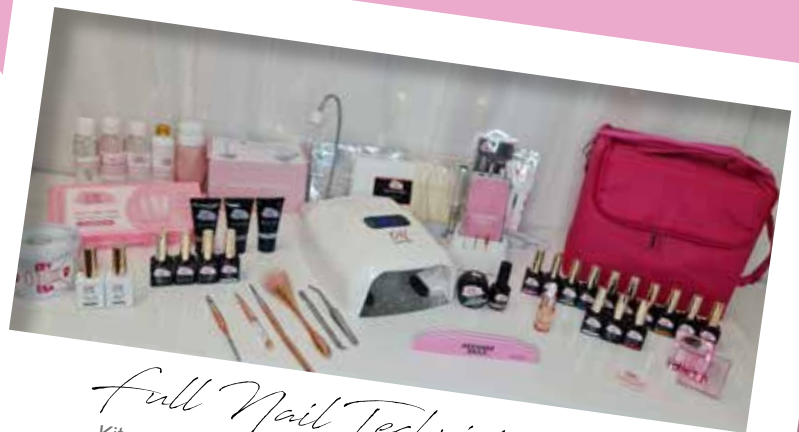
Full Nail Technician kit Kit contents subject to change; some items may differ

Practical exam (5-in-1 burr bit allowed for de-bulking): 1 hand Sculpted Acrylgel Extensions with top coat; 1 hand Sculpted French Acrylgel Extensions